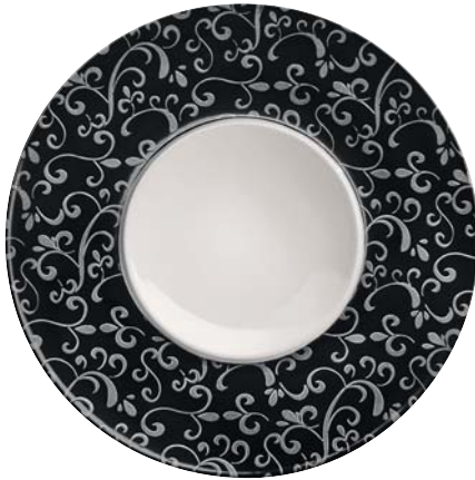
422080 Glimmer Floral

Dekor erhältlich auf / pattern available on: 07 0616 Exquisitfahneteller flach 16 07 0634 Exquisitfahneteller flach 34 71 6909 Untertasse rund coup 71 6918 Kombi-Untertasse rund coup