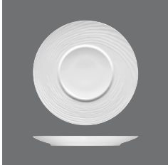
Strukturteiler , Plate flat with structure, Assiette plate avec structurale, Plato llano con estructura, Piatto piano con rilievo