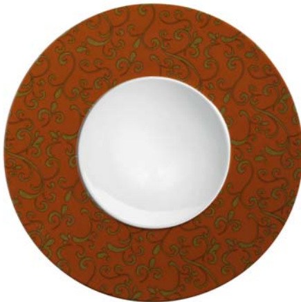
423350 Glimmer Floral Terrakotta

Dekor erhältlich auf / pattern available on: 07 0616 Exquisitfahneteller flach 16 07 0634 Exquisitfahneteller flach 34 70 0032 Teller flach Fahne 32 70 0628 Teller flach breite Fahne 28 70 0728 Teller tief breite Fahne 28