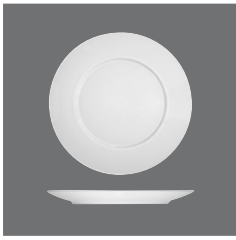
Exquisitfahnteller flach , Plate flat exquisite with rim, Assiette plate exquisite avec aile, Plato llano exquisita con ala, Gran Gourmet Piatto piano