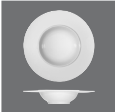
Exquisitfahnteller tief , Plate deep exquisite with rim, Assiette creuse exquisite avec aile, Plato hondo exquisita con ala, Gran Gourmet Piatto fondo