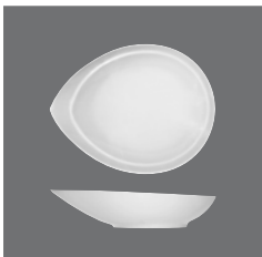
Blütenschale , Bowl bloom, Ravier fleur, Bowl flor, Coppetta a fiore