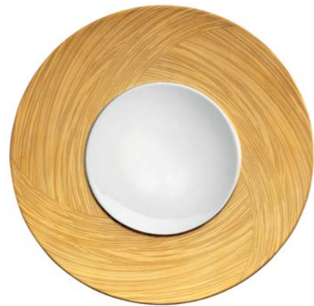
425045 Golden Structure

Dekor erhältlich auf / pattern available on: 07 0616 Exquisitfahneteller flach 16 07 0634 Exquisitfahneteller flach 34