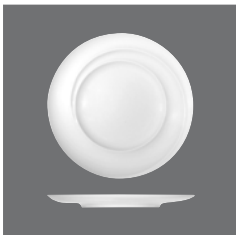
Spiralteiler , Plate spiral line, Assiette spirale, Plato estructura, Piatto a spirale